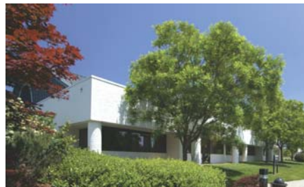
Eastern Government Center 3820 Nine Mile Road 652-3600