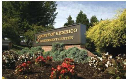
Government Center 4301 East Parham Road 501-4000