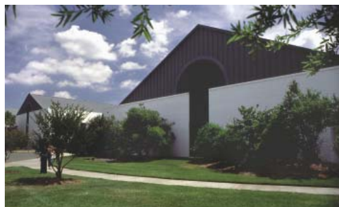
Eastern Government Center 3820 Nine Mile Road 652-3600