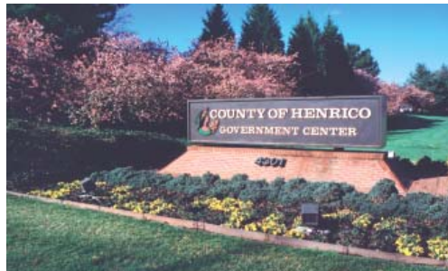
Government Center 4301 East Parham Road 501-4000