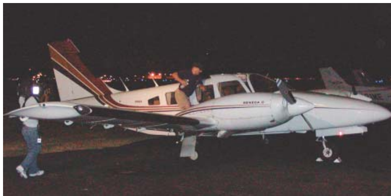
Angel Flight 3 Delta Kilo departed for Waveland, Miss. at 5:45 a.m., Sept. 26 to carry needed supplies to the area.