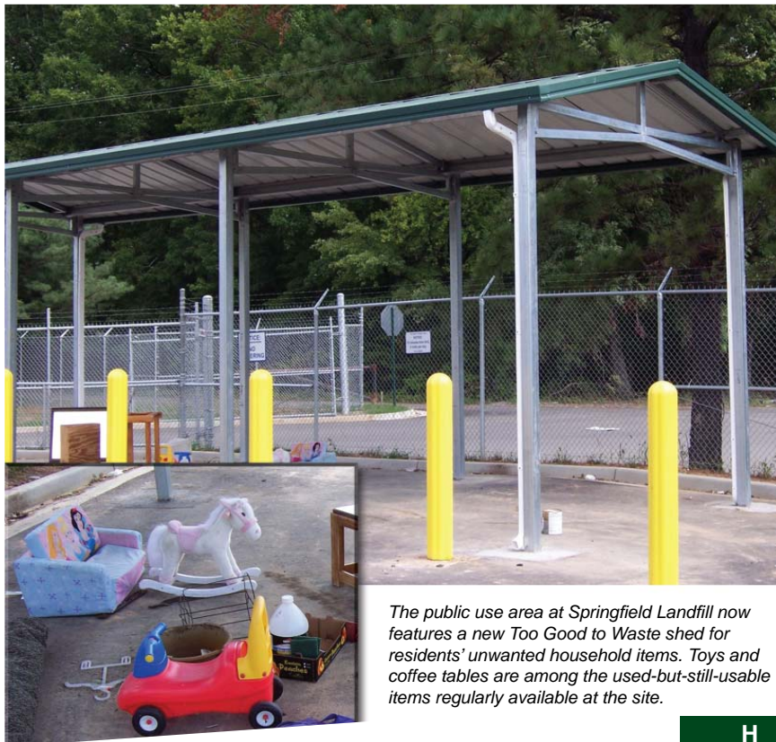
The public use area at Springfield Landfill now features a new Too Good to Waste shed for residents' unwanted household items. Toys and coffee tables are among the used-but-still-usable items regularly available at the site.

For more information about recycling and curbside collection, log on to the CVWMA Web site at www.cvwma.com or call the recycling hotline at 340-0900.