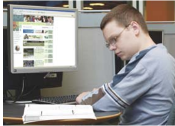
The Henrico Education Foundation has provided more than $1 million for students and innovative projects in Henrico’s public schools since 1998.

ley said, since it gives students a snapshot of the real world. It also presents challenges, she noted, such as the ongoing growth in the system’s English as a Second Language program.