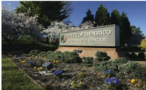
Government Center 4301 East Parham Road 501-4000