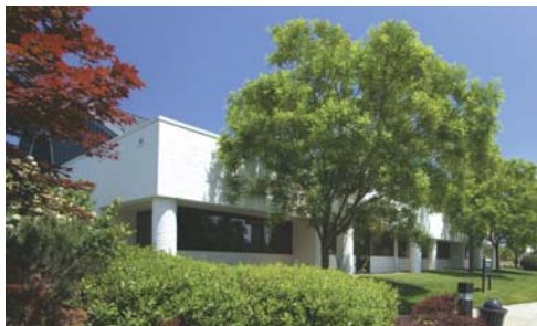
Eastern Government Center 3820 Nine Mile Road 652-3600