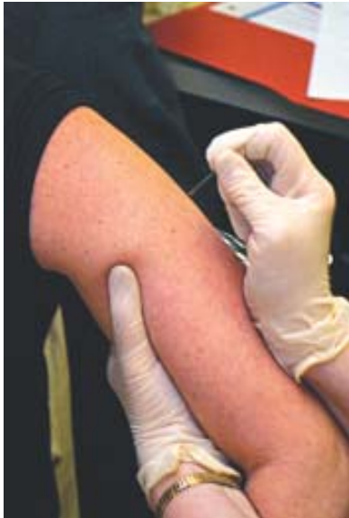
Henrico public health staff are among the first to receive the smallpox vaccine in Virginia.