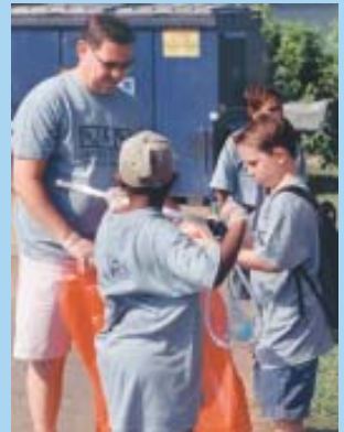
Armed with the tools of the trade—gloves, fish nets, trash grabbers and bright orange collection bags—some youngsters prepare to get busy at the 2002 event at Osborne Landing. People of all ages can lend a hand to the 2003 cleanup effort—to register, call 717-6688 or go to www.jamesriveradvisorycouncil.com .