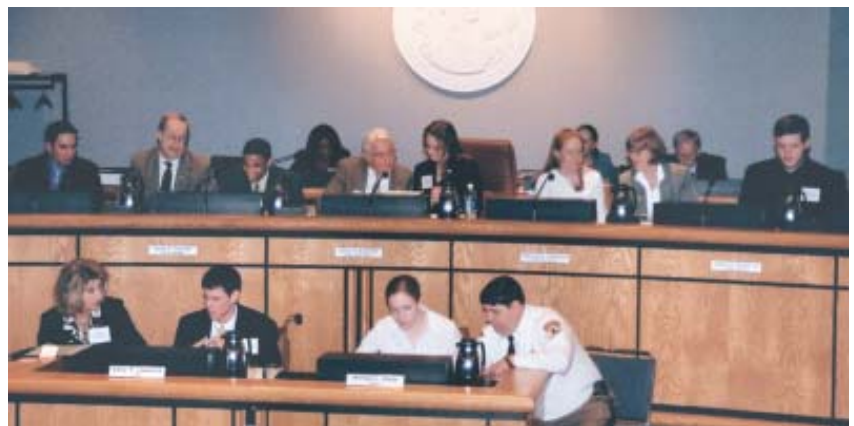
Students and their government counterparts conduct business during the mock Board of Supervisors meeting.

Students “shadowed” their government counterparts throughout the day, gaining insight into the