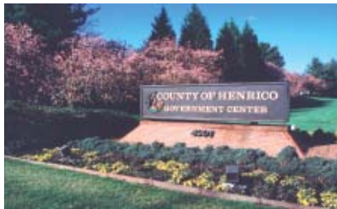
Government Center 4301 East Parham Road 501-4000