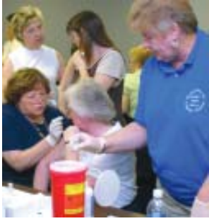
As part of the county's ongoing emergency preparedness efforts, Henrico Health Department staff receive hands-on smallpox vaccine training using a bifurcated (two-pronged) needle and saline.

the vaccination of smallpox response teams. The teams are part of the nation's voluntary vaccination program to protect Americans from the potential threat of a terrorist attack involving the release of the smallpox virus.