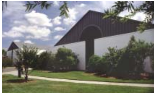
Eastern Government Center 3820 Nine Mile Road 652-3600