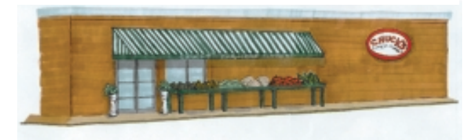
Two design schemes for facade enhancement of Chuck's Supermarket (TOP VIEW: Structural/awning/sign/display enhancement, BOTTOM VIEW: Awning/Sign enhancement)