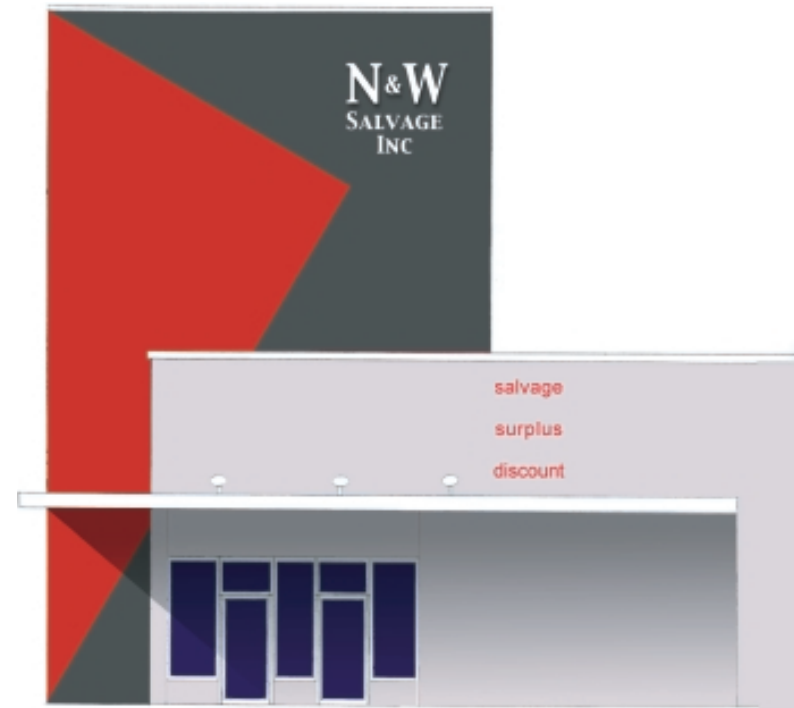
N & W Salvage proposed sign graphic's enhancement