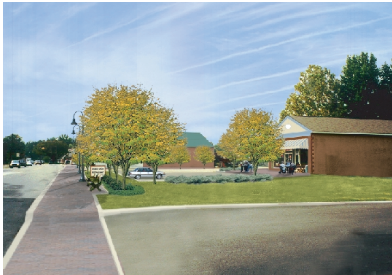
An artist's rendering of potential improvements to the Shake Shop