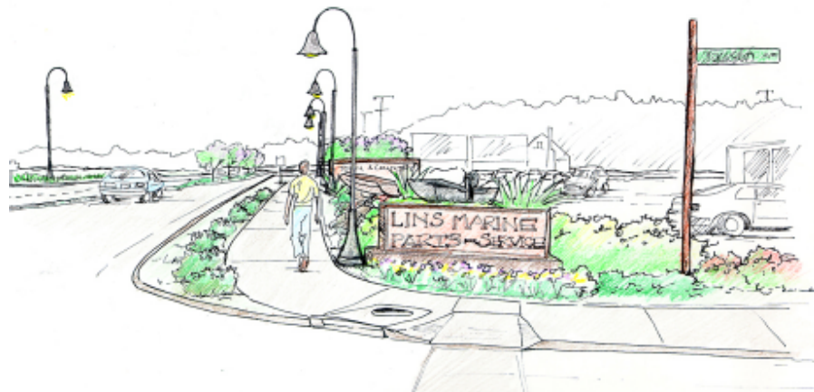
Sketch of proposed improvements at 400 W. Williamsburg Road and the western corridor entrance